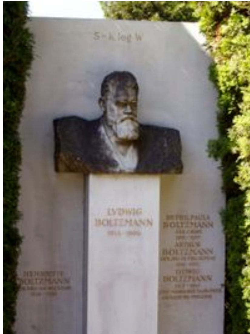
Boltzmann's grave in the Central Cemetery of Vienna, with his entropy formula