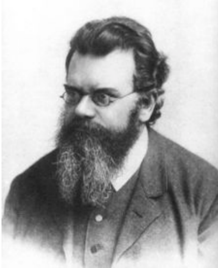
Ludwig Eduard Boltzmann (1844-1906)