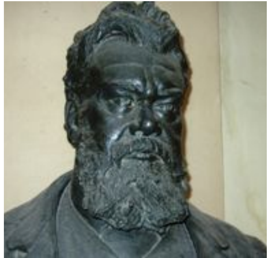
Boltzmann's bust in the courtyard of the main building, University of Vienna